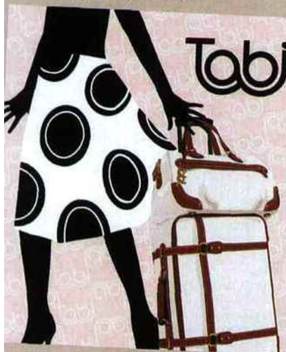
The logo design for the launch of a new Japanese luggage brand from the Group ACE.