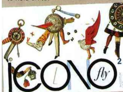
Cover of the luxury accessory lookbook for iconofly

Ich & Kar is the impertinent graphic design duo working in tandem to create pertinent designs on a variety of subjects for some very top-notch clients. Always outlandish but never outdated, their creations tend to take a visual leap into the psyche and come back with beautiful minimalist creations that appeal to the consumer. Press kit for Chanel lovely enough to hold on to.